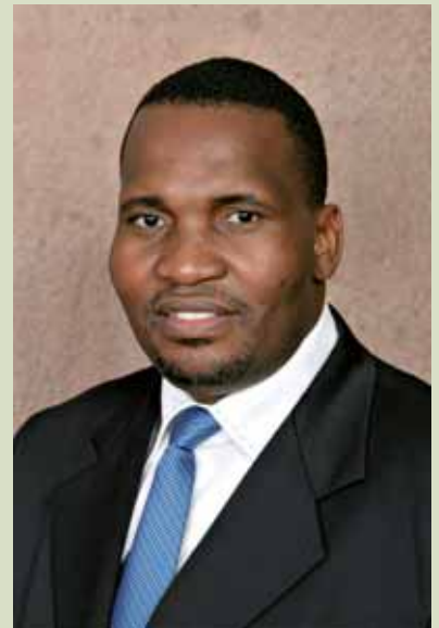
Mr Sicelo Shiceka, MP